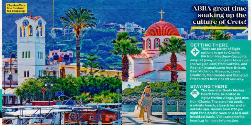
Chania offers fine food and fab shopping

Chania (pronounced Hania) is the second-largest city in Crete, and famous for its Venetian harbour, waterfront restaurants and narrow shopping streets. Or book a boat trip around the magical island of Thodorou. Greek mythology says the island was created when a huge monster threatened a town, and the gods turned it into stone. From the beach, you can see the 'open mouth' of the monster. It has also been used as a military base to protect Crete from invasion by the Turks. If you fancy a snorkel, you can spot a wide range of wildlife, as well as a WWII German plane on the ocean floor directly in front of the island.